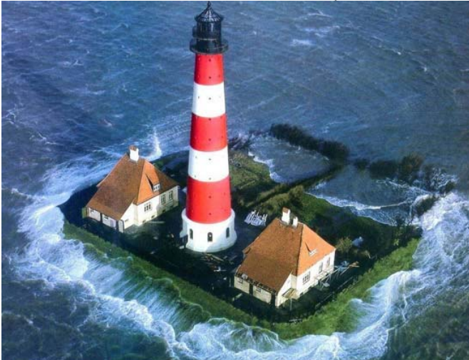
GOT A LITTLE PROBLEM WITH DAMPNES AT YOUR HOUSE?