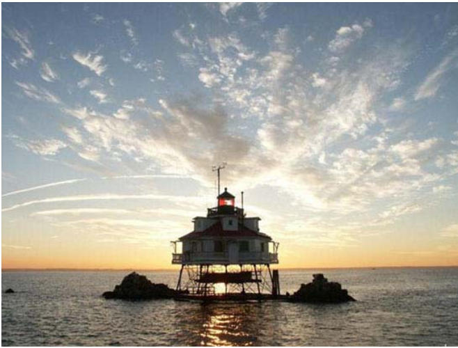
Beautiful sunsets or sunrises but