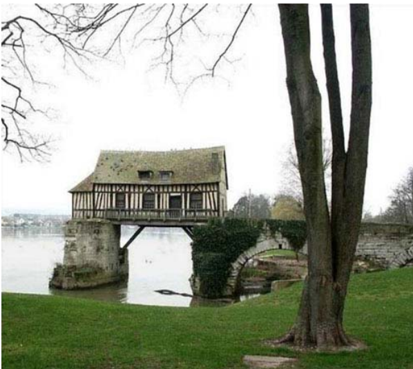
BUT THIS IS RIDICULOUS!